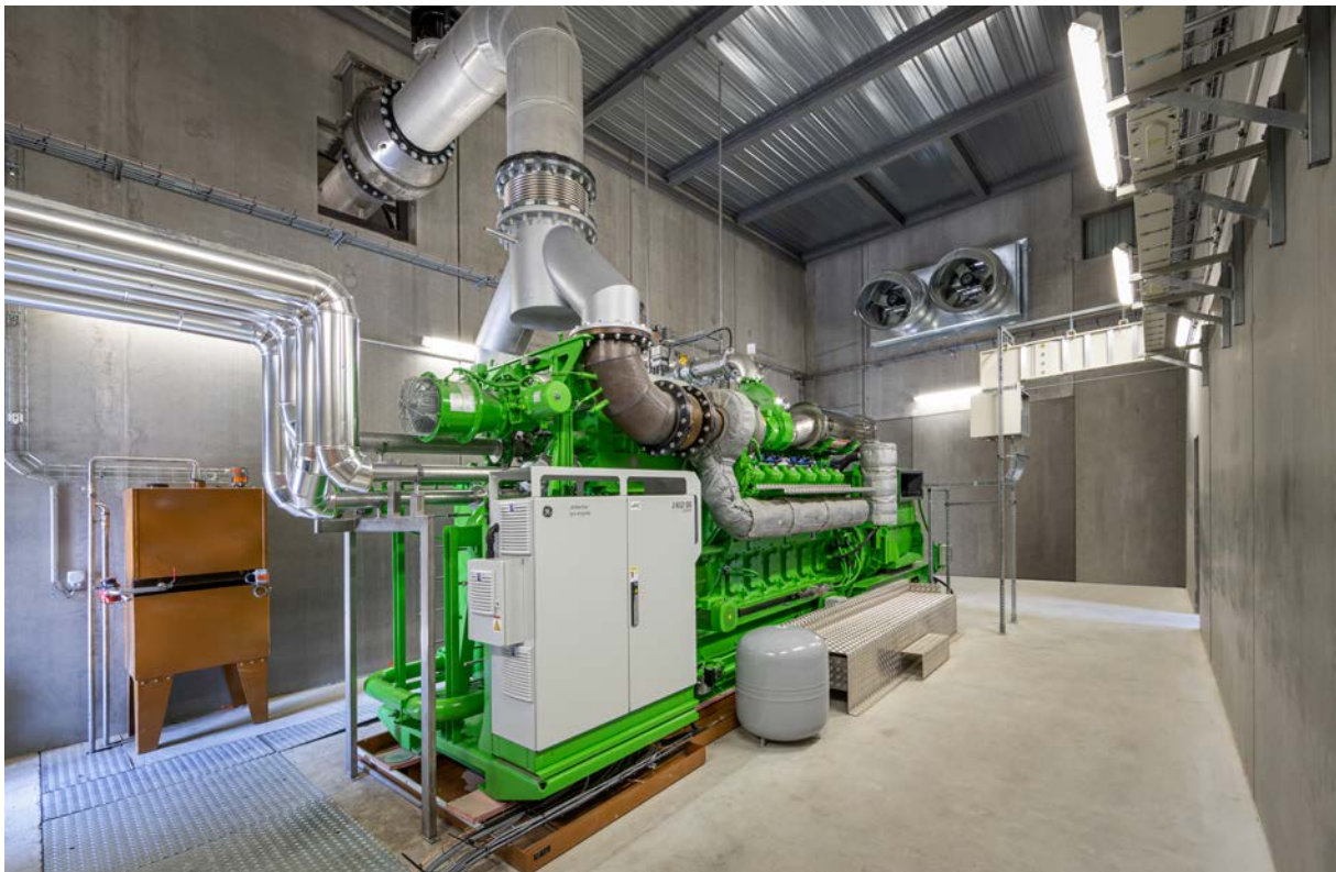
Picture: CHP unit for power and heat generation

Biogas can be generated 24 hours a day, 365 days a year. Decentralized energy generation also guarantees sustainable local development.